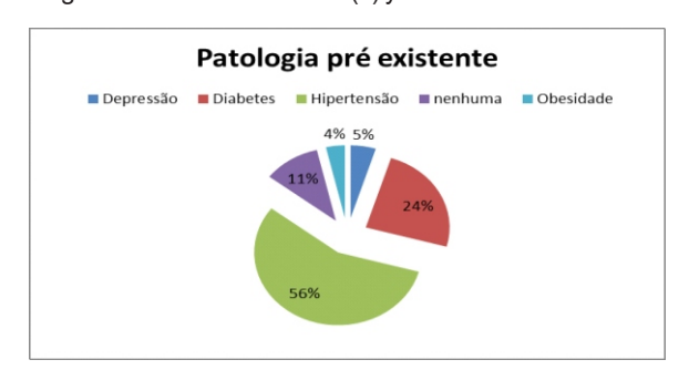
Chart 3: Among the existing Pre diseases which one (s) you had?

A sedentary lifestyle is a facilitator for the onset of diabetes mellitus, disease that comes with little peripheral irrigation, lower limb amputations, disability status and high doses of medication to obtain their control, such as obesity that triggers the previous two redounding in a metabolic syndrome in addition to depression, often the result of loss of functional capacity, lack of time occupation and lack of social integration (BUSKAMAN 2012). The group investigated noted that 56% of seniors have hypertension, 24% with diabetes, 5% with depression frame and 4% obese, and 11% of students did not have any previous condition the practice of physical activity with the Program quality of Life and Aging Healthy Active Living Mangabinha.