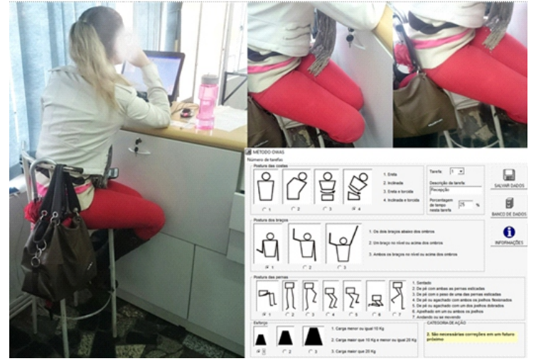
Figure 2 - Layout seat and bench for use at the desk next to OWAS analysis by Ergolândia software 5.0 trial version

It was found that back pain and legs were frequent, according to the testimony of the receptionist. This is evident on the provision in the counter and the reception seats are allocated. Figure 2 shows that provision, where, along with the use of specific software, it was possible to check for interferences in the welfare of this collaborator.