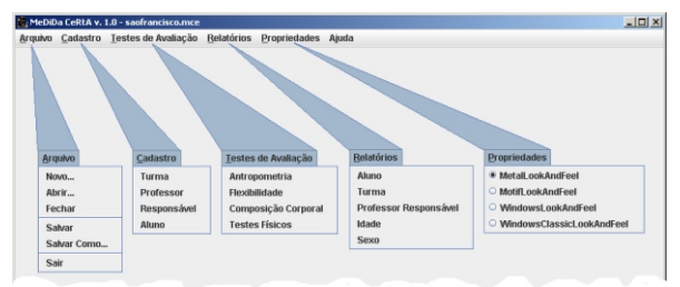
Figure 1: Menu options and main screen of "Medida-Certa".

The accomplishment of these steps is supported by the program whose main screen and the set of available options are illustrated in Figure 1. Due to the limit of pages, the figure appears with clippings. To illustrate its use we registered in the tool the data corresponding to a group of 26 children of the San Francisco College at Anápolis city (Goiás, Brazil).