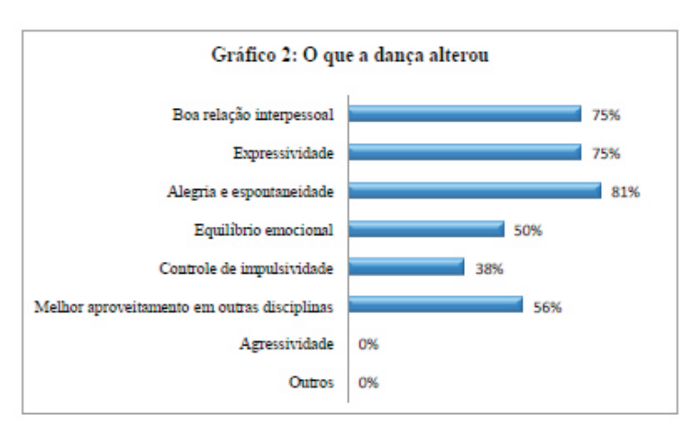
Chart 2 presents the results for the question "What was changed by Dance". The purpose of this question is to investigate the probability of dance being factor modifier of social skills, according to what parents noticed in their daughters.

The greatest indicator corresponds to the "joy and spontaneity" (81%), important factor for the unpopular neglected children, which tend to depression and loneliness. Now, the lowest indicator is about "aggressiveness" (0%). The practice of