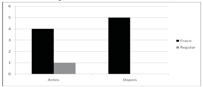
Chart 1 - Classification of subjects in the control group for the index of GDLAM at both times of testing.

Chart 1 can be seen that 20% of subjects in the control group showed a worsening of their condition checked by the Protocol GDLAM, where it was noted that while previously only four subjects had a Poor condition, after the development period study all subjects reached Poor condition, showing deterioration in the condition observed.