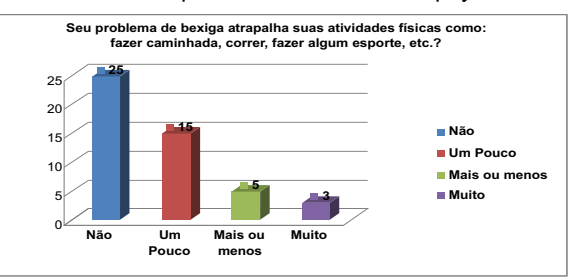
Chart 3 - physical limitations: "Your bladder problem that affects their physical activities?"

The limitation in physical activities is a common complaint in carriers of stress urinary incontinence or mixed urinary incontinence (TAMANINI et al, 2003). This affirmative not corroborated with the study in pregnant women, because the analysis of the data portrayed in this chart, shows that 25 out of 48 pregnant women do not have urinary minimum losses in any activity. In contrast only 3 of them lose much urine, 15 lost a little more and 5 or less.