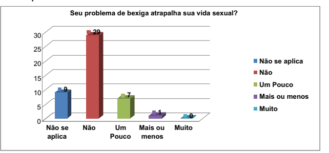
Chart 5 shows that only 7 out of 48 pregnant women who find the UI affects their sexual activity a little, 1 affects more or less, no reports that affects very, 9 does not apply (for not having fixed partner) and most was that 29 of them reported that the loss of urine does not affect their sex life.

The pregnancy is one of the significant periods that make up the life cycle of women, influencing their sexuality. During this period, the sexuality of pregnant women is affected by several factors, such as changes in the perception of body image, decrease in the level of energy, presence of physiological symptoms and bodily discomfort. (POLDEN, 2002).