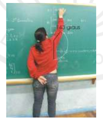
Figure 01 - Abnormal Abduction of the arm in the Interaction Professor Black

Vigorous and repetitive movements of the superior members, with arms above the shoulder level (and even more critical, above the head level), result in tendon clamping of the supra-spinal muscle, between the humerus head and the coracoacromial ligament, resulting in ischemia, inflammation and pain; repeatability leads to calcification, which perpetuates the inflammation, especially when the raising is above 45 degrees (MAGEE and OLIVEIRA, 2005).