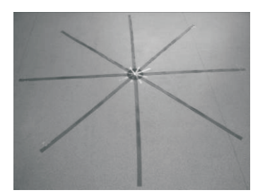
Figure 1 – Star Excursion BalanceTest – the provision of soil testing during the evaluation.

For the proprioceptive evaluation, we used the Star Excursion Balance Test (SEBT), which consists of eight straight lines of 120 cm long and three centimeters wide, made of Le Baron plastic or Napa put on the floor, and these lines, start on a single point, forming a center where there is an angle of 45 degrees between each line (Figure 1). The lines were sewn together in the center formed.