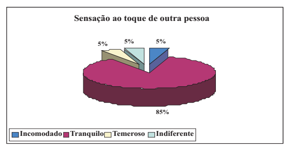
Chart 3: Feeling the touch of other practices of interpersonal relationship

In question 2, emphasizing the importance of these experiences observed in the chart above, 17 research subjects, which means 81% of respondents, show how essential the body experiences the process of training in physical education. The remaining 19% of respondents, which represent only 4 students from the total, identified only as needed, the experiential content for Vocational Training. None of the individuals will understand how unnecessary Training the body experiences in the Physical Education Course. This way you can confirm the importance attached by students of physical education classes of body experiences during the course.