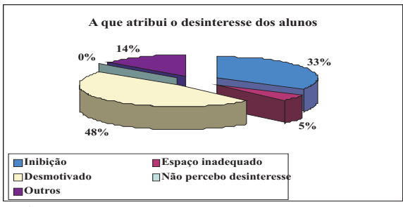
Chart 5: Interest of students for practice

When hearing about their own preparedness to deal with the body of other people in the professional intervention, 100% of respondents said fully prepared to act professionally. The majority of the group attributes this self-confidence to the formation received, knowledge gained and the experiences obtained during the course to reach this moment. "I think throughout my academic life, with the experience gained today I can act consistently. However, among those who claim to act professionally prepared with human embodiment, to justify their answers some preferred to omit and others show little justification consistent with that previously reported or not directly related to the proposed inquiry. "I think the work ethic is above all because this is part of the profession. "The goal is to help our clients / students."