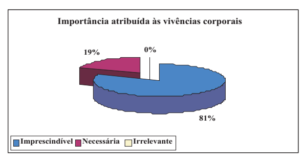
Chart 2: Importance of body experiences for professional activity.

Based on these data we can see the great interest of students of Physical Education, the experiential lessons during training, and it is not shown the same lack of interest among the objects of the group studied.