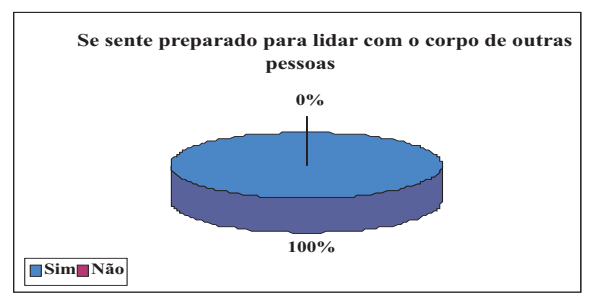
Chart 4: Preparing to deal with the bodies of others in professional action

The data collected show that 18 of the 21 respondents are relaxed about the practices of interpersonal relationship, when their bodies are touched by other people. And see it as very natural, since it occurs in a respectful and professional.